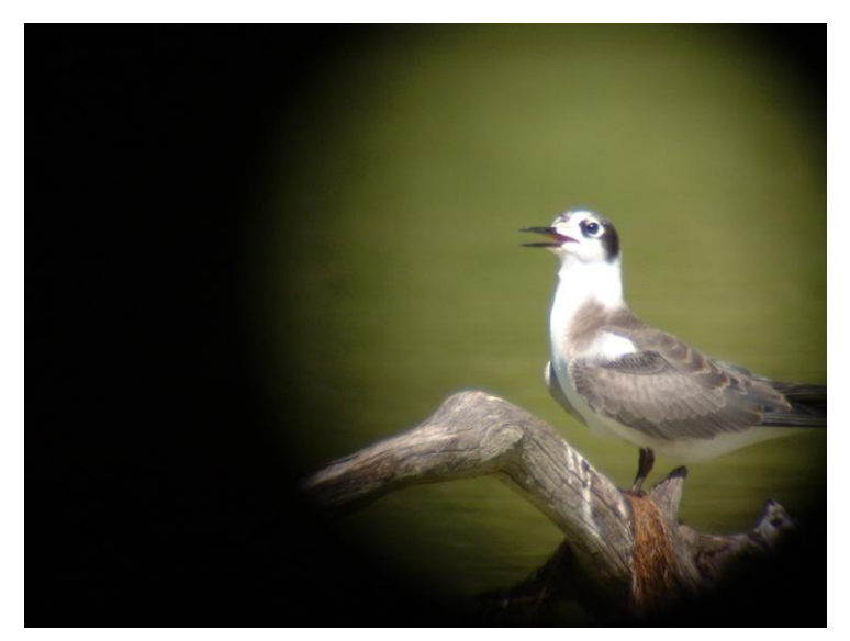
Immature Black Tern – through the spotting scope at Spittal Pond

The fall season is the most eagerly awaited time of the year for local birders. Most migrants are predictable in their arrival dates while there are always unexpected vagrants to be found. The fall-out of migrant birds in Bermuda is closely related to